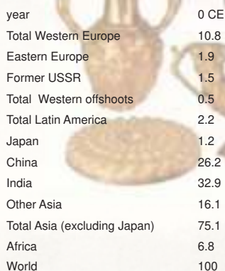
Share of Countries /regions in world GDP (0 CE)

At that time, the great strides made by India as the world's economic super power would not have been possible without the contributions of the different sectors of our economy such as agriculture, industry and trade along with the skilled and talented citizens of those days.