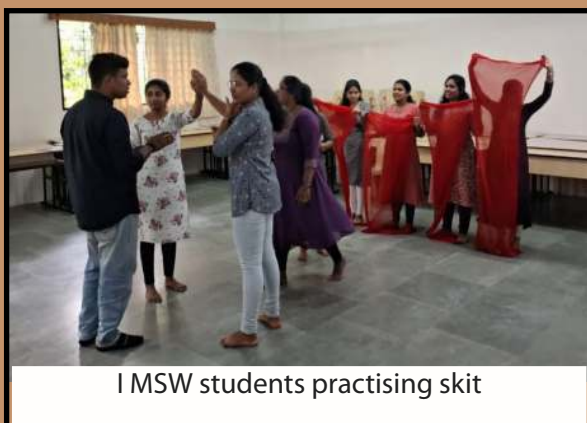
I MSW students practising skit