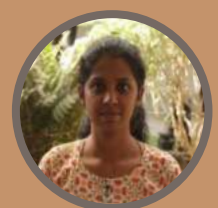
VINAYA VM (II MSW)