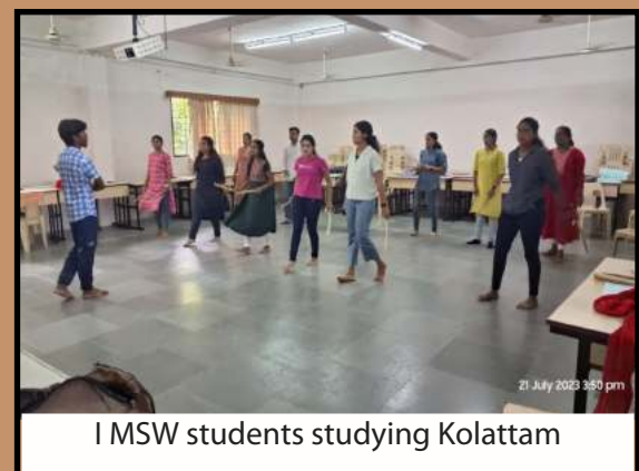
I MSW students studying Kolattam