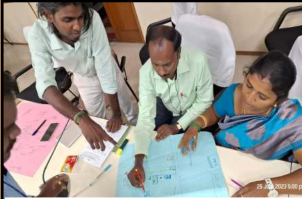
Group activities during the session