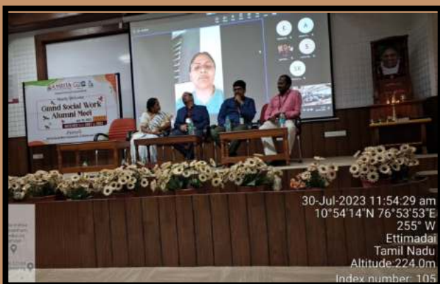
Dignitaries on the stage