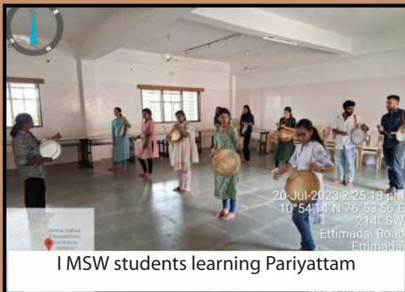
I MSW students learning Paraiyattam