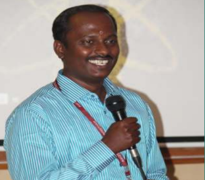
FACULTY CHIEF EDITOR