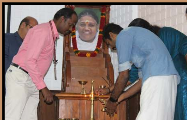
Dignitaries on the dice lighting the lamp