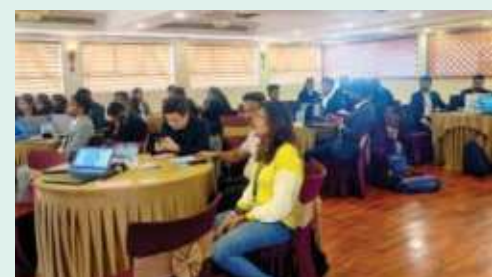
Lionsbot Placement Drive held at Chennai