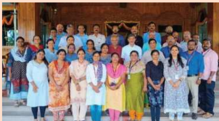
CIR and ASB Team at Amritapuri