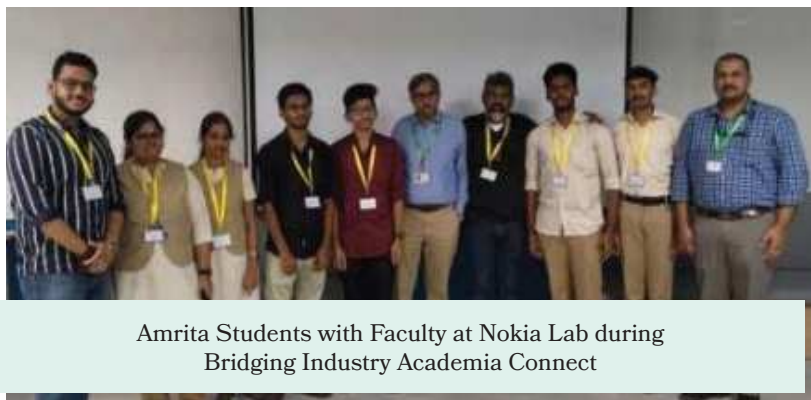
Amrita Students with Faculty at Nokia Lab during Bridging Industry Academia Connect