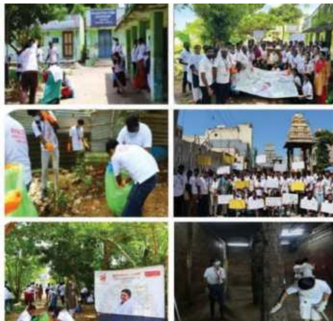
Clean up Drive at Shree Veera Raghava Swamy Temple at Tiruvallur and Cholavaram Panchayat Primary School, Siruvapuri

These initiatives were not only a resounding success but also brought the college community closer, instilling a sense of responsibility to the environment. This serves as a compelling reminder of the impact of small actions in creating a healthier and cleaner environment."