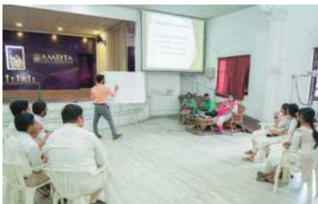
Quiz Competition in Progress