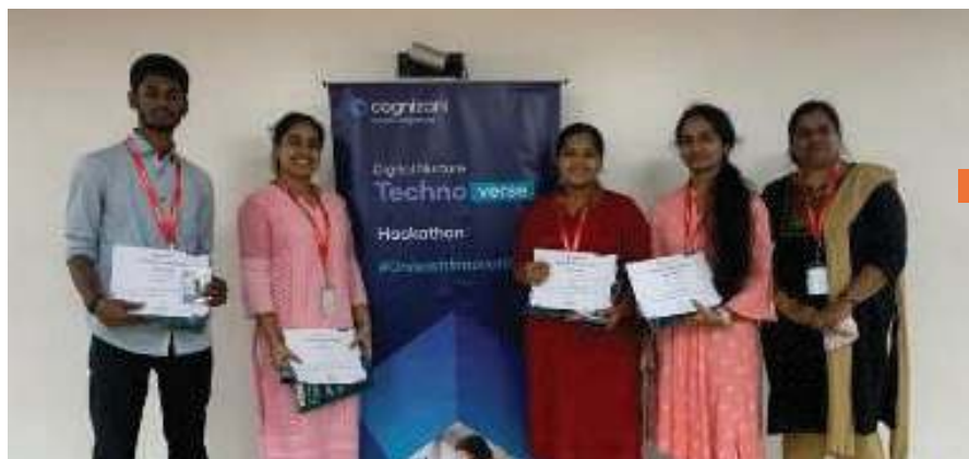
Cognizant Digital Nurture Technoverse 2023 hackathon Amrita Team with Mentor

Digital Nurture Technoverse 2023 was organized by Cognizant. CIR facilitated the registration for the participants. Each campus of Amrita sent two teams. Amrita Chennai team comprising students from ECE and CCE was the only team that made it to the top 10 among 152 teams from all over India. The team harnessed cutting-edge technologies, for real-time stress detection by employing sensors for heart rate and Electro dermal Activity (EDA) seamlessly fitting into users' routines. Hardware lineup featured EDA and heart rate sensors, Arduino Nano BLE for wireless data transmission, and Raspberry Pi for data processing with a machine learning model, boasting a commendable 95% accuracy in controlled tests. Adapting to real-world unpredictability posed challenges, aiming for a practical 70-75% accuracy. This hackathon nurtured creativity, effective collaboration, continuous learning, extensive networking, and fierce competition, a transformative experience shaping future endeavors.