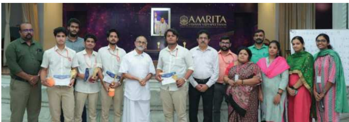
Winning Team with the Director and CIR Team