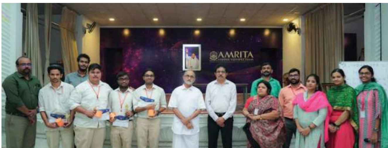
First Runner-up with the Director and CIR Team