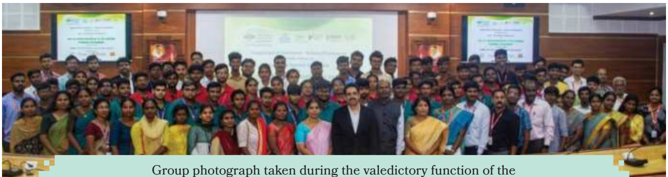
Group photograph taken during the valedictory function of the national conference on Entrepreneurship

Here are some photographs from the event.