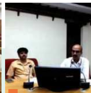
The ACE Team's online clarification session on 26th August