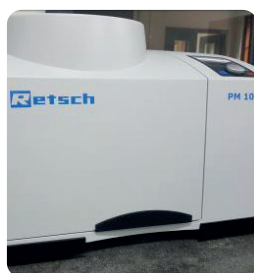
BALL MILLING UNIT