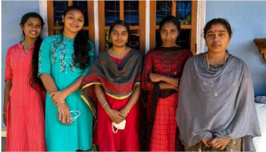
Water Ambassadors, Wayanad

From the first week of January 2022, Phase 2 of WISE Project (Women in Sustaining the Environment) in collaboration with Tel-Aviv University, Israel began in Nellarachal Village in Wayanad. The Project is now in its final phase and five Water Ambassadors have been successfully trained in the community. The training involved topics related to water, its quantity and how to effectively monitor its quality parameters. The women were trained on how to utilise a survey tool created by the AmriTAU Team to collect household information on water quality, their attitudes and practices. The monitoring and maintenance work women do in their villages is an integral part of sustainability of their natural resources. As we move forward, the project will focus on the next phase of training and deployment.