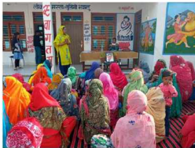
Women in Kanti Haryana attend a SMART SHG leader training