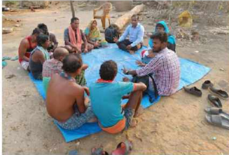
Pictured Here: Meetings at Gobardhanpur, Diha Sahi, Munda Sahi, and Tanchira with active participation of prospective beneficiaries