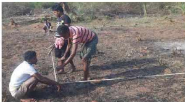
Layout and land clearing process at new villages