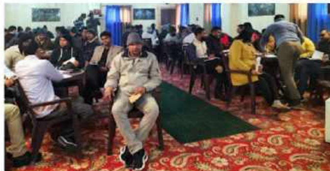
Jawans participate in breakouts and group discussions about gender-related issues.