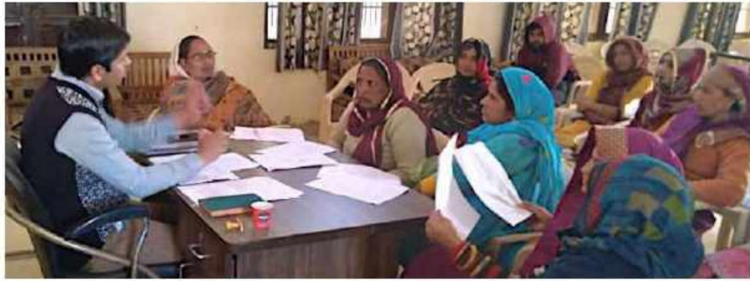
Women's SHG wins the top prize as a stellar SHG. The Amma Pooja SHG in Haryana was awarded a cash prize of 1 Lakh Rupees (around $1305 USD) by the National Rural Livelihoods Mission

Women's SHGs are collectives of change that empower and uplift both participants and communities.