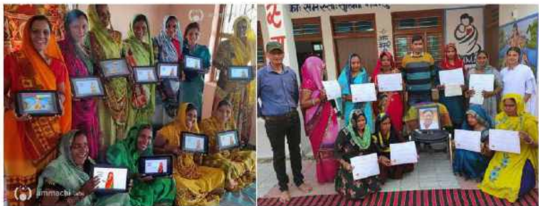
Post-training smiles from participants of the SMART SHG in North India. The SMART SHG project uses communication technologies as a platform to create viable business models to advance the socio-economic empowerment of women-run cooperatives in Northern India.