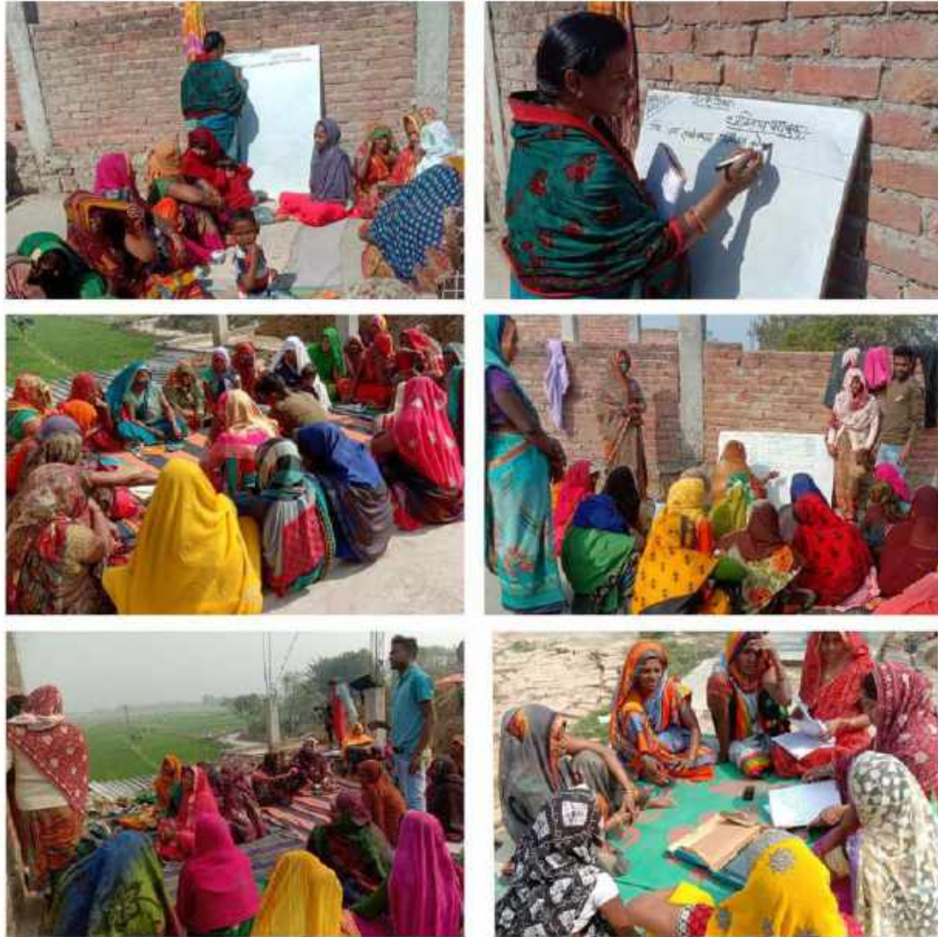
Women from Uttar Pradesh participate in the SMART SHG Project

In March, member training for the SMART SHG project in Uttar Pradesh was completed. The project was a success in UP because of all the wonderful women who genuinely wanted to be a part of a SHG and make a change in their lives and for others.