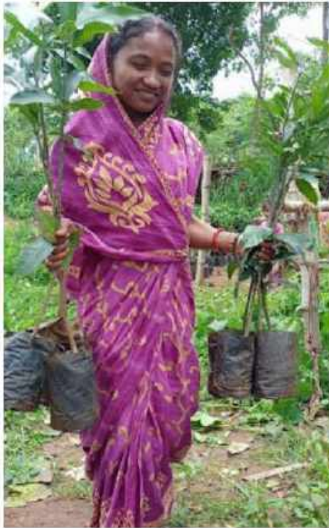
Pictured Here: Woman in the tribal belt of Dhenkanal Dt. Odisha gathers fruit saplings to be planted.

The project aims to develop and implement a comprehensive strategy for sustainable development of tribal families in Odisha.