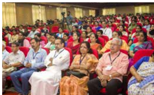
The audience assembled in Acharya Hall, Amritapuri Campus