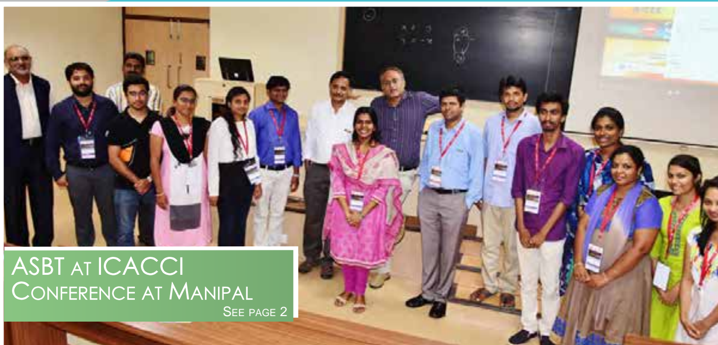
ASBT AT ICACCI CONFERENCE AT MANIPAL