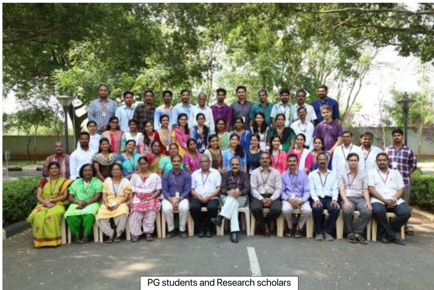
PG students and Research scholars