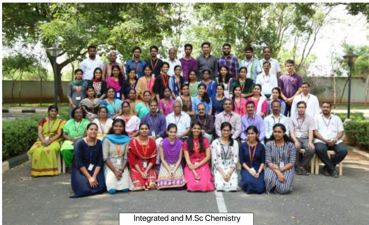
Integrated and M.Sc Chemistry