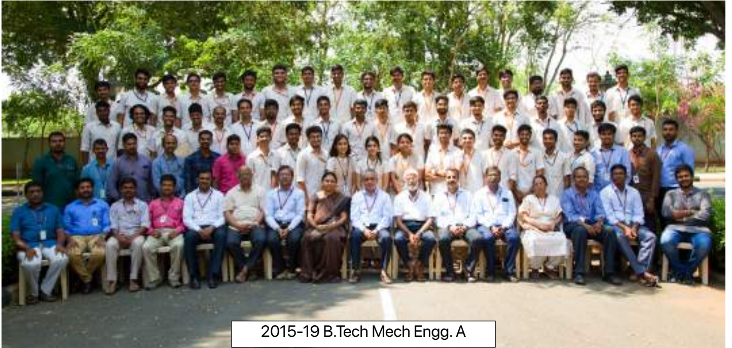
2015-19 B.Tech Mech Engg. A