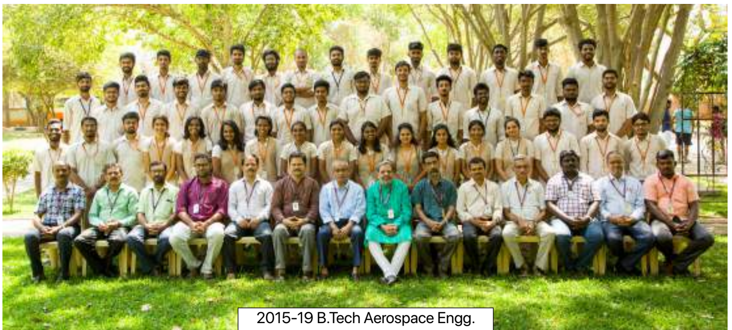
2015-19 B.Tech Aerospace Engg.