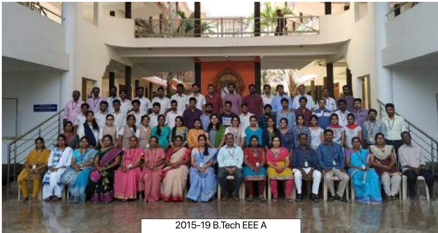
2015-19 B.Tech EEE A