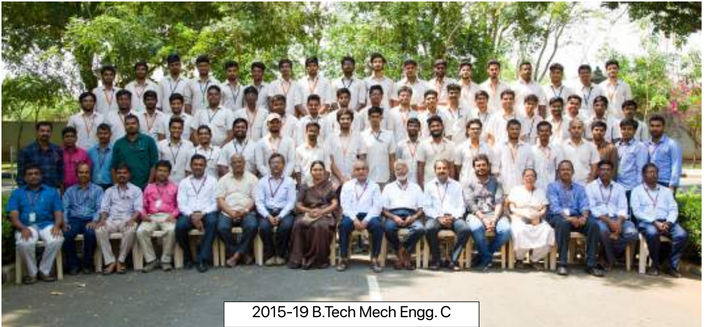
2015-19 B.Tech Mech Engg. C