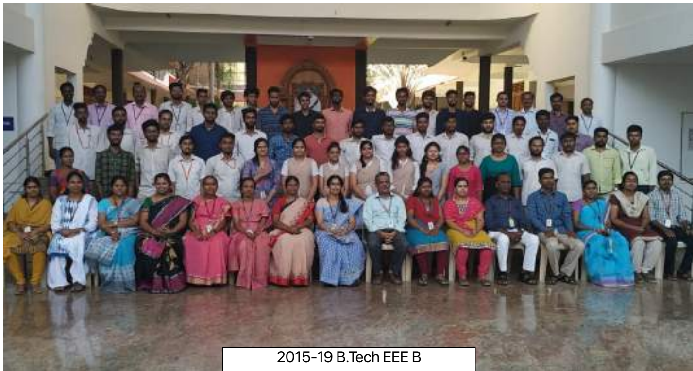
2015-19 B.Tech EEE B