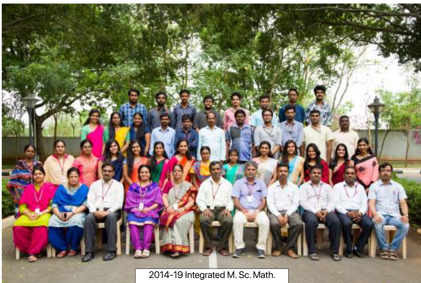
2014-19 Integrated M. Sc. Math.