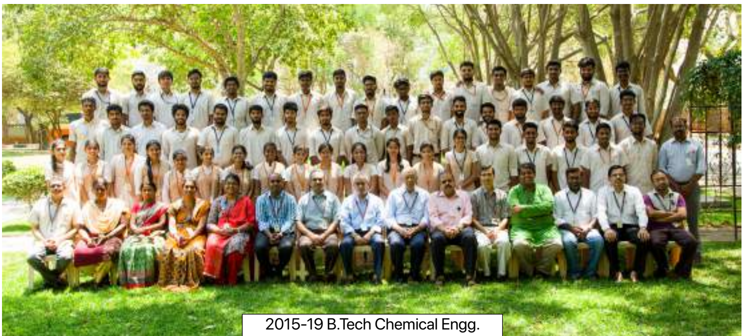
2015-19 B.Tech Chemical Engg.