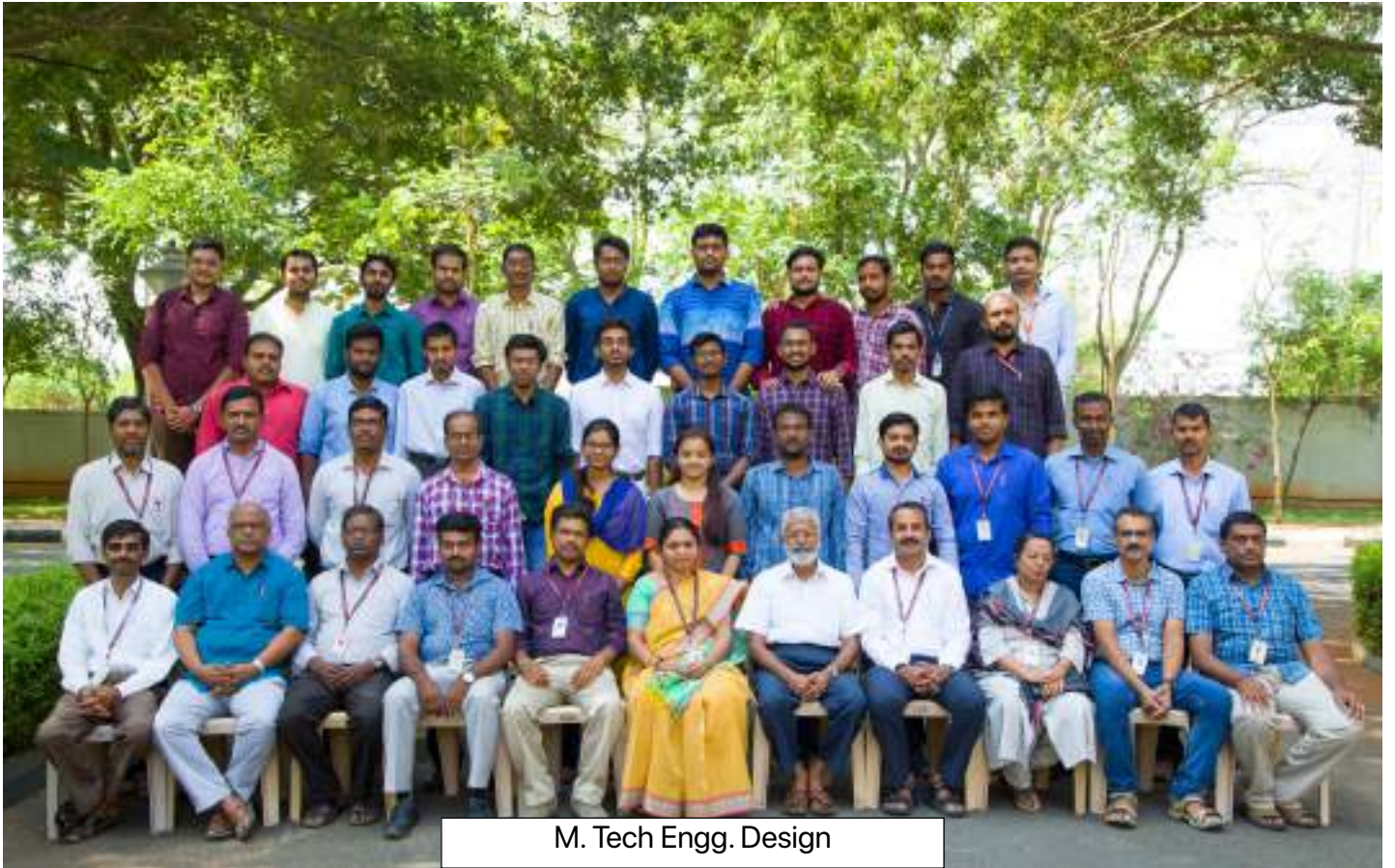
M. Tech Engg. Design