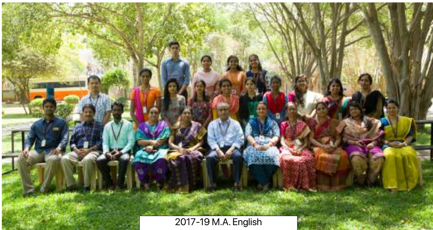
2017-19 M.A. English