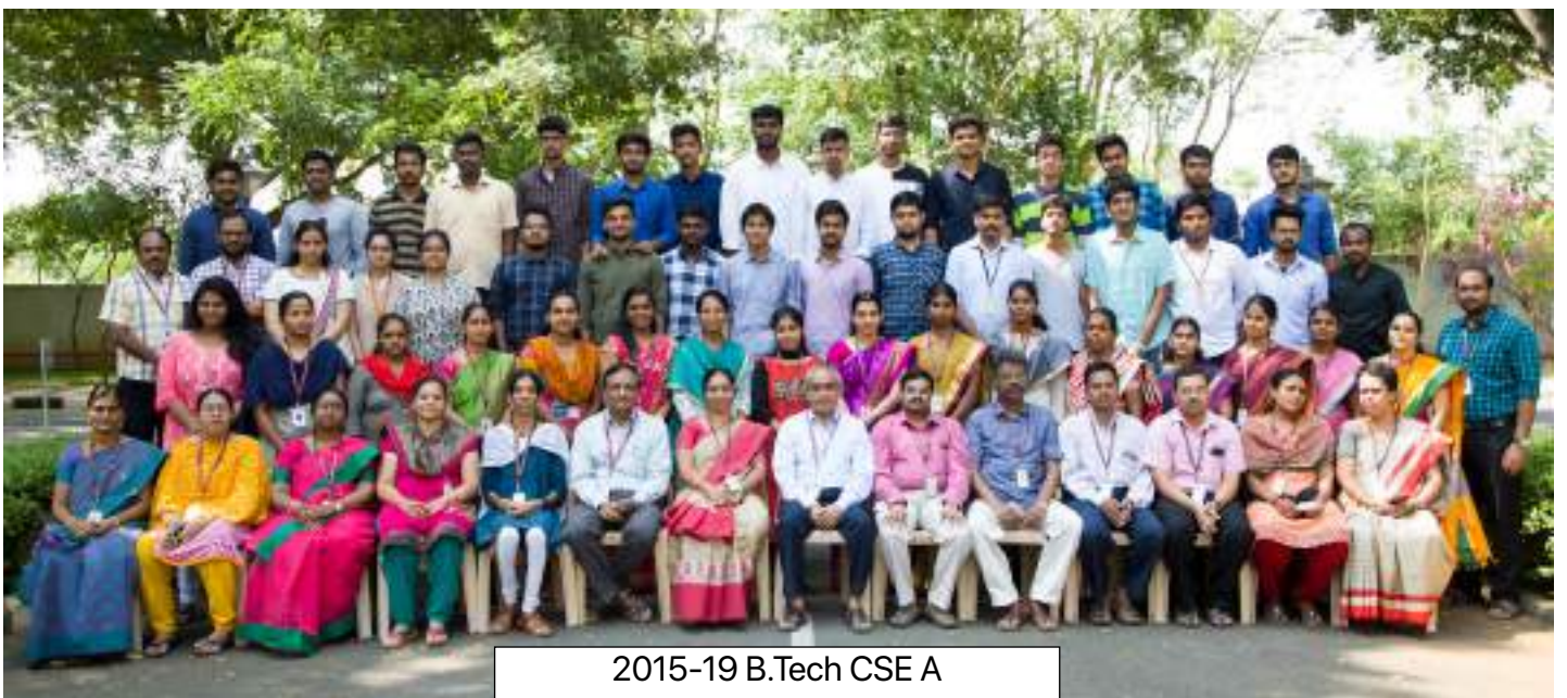
2015-19 B.Tech CSE A