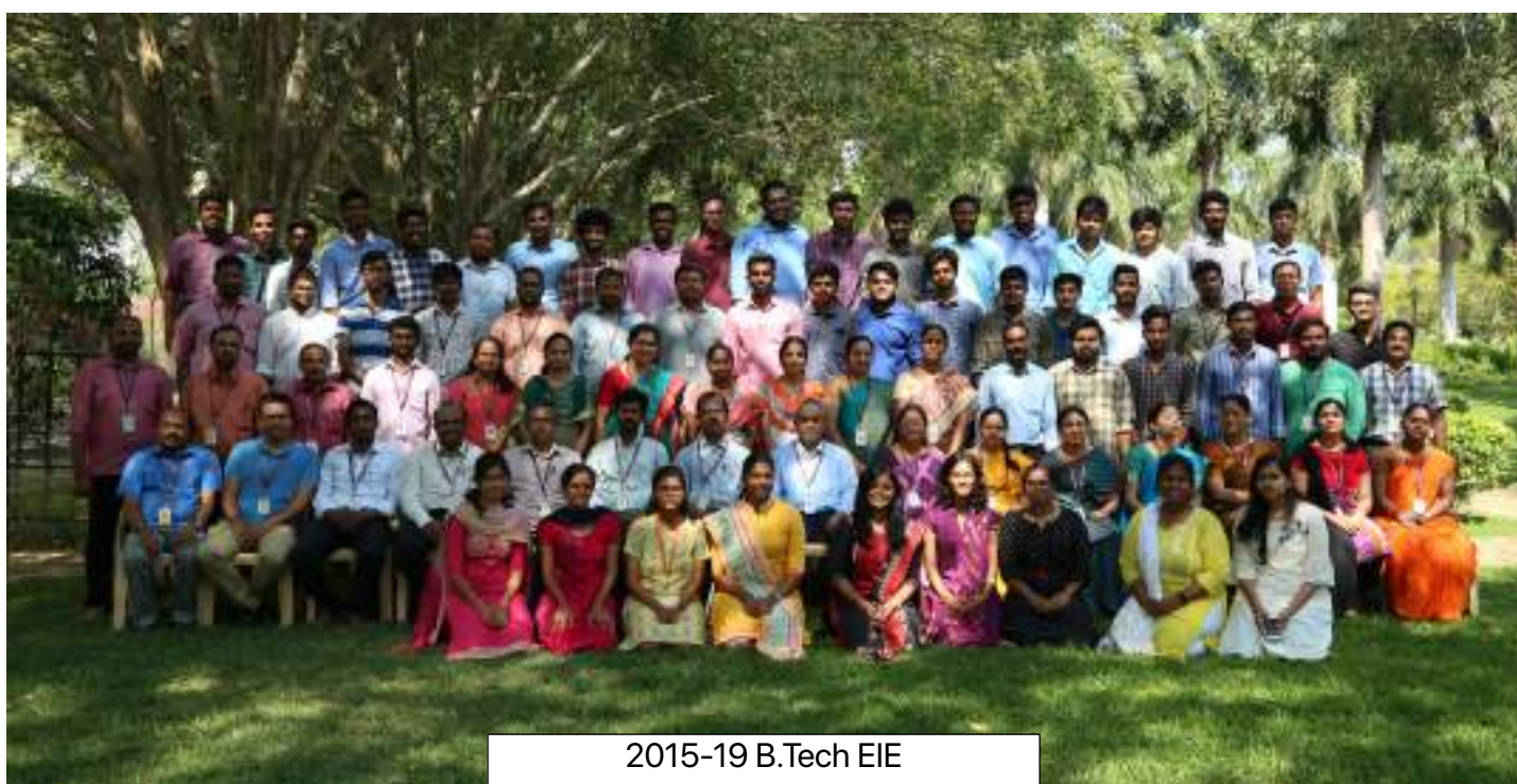
2015-19 B.Tech EIE