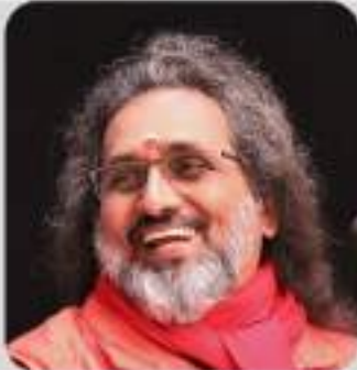
SWAMI AMRITASWARUPANANDA PURI