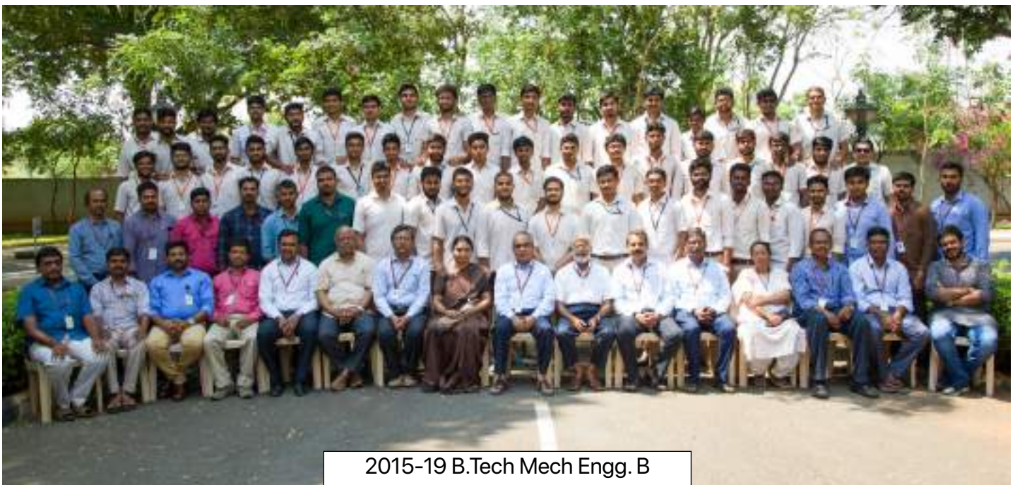
2015-19 B.Tech Mech Engg. B