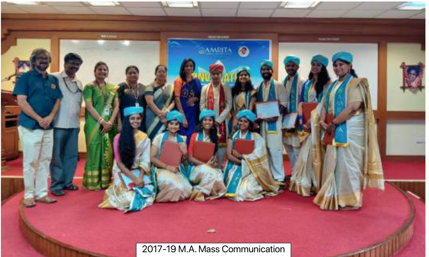
2017-19 M.A. Mass Communication