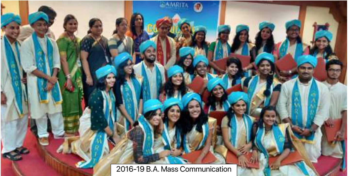
2016-19 B.A. Mass Communication