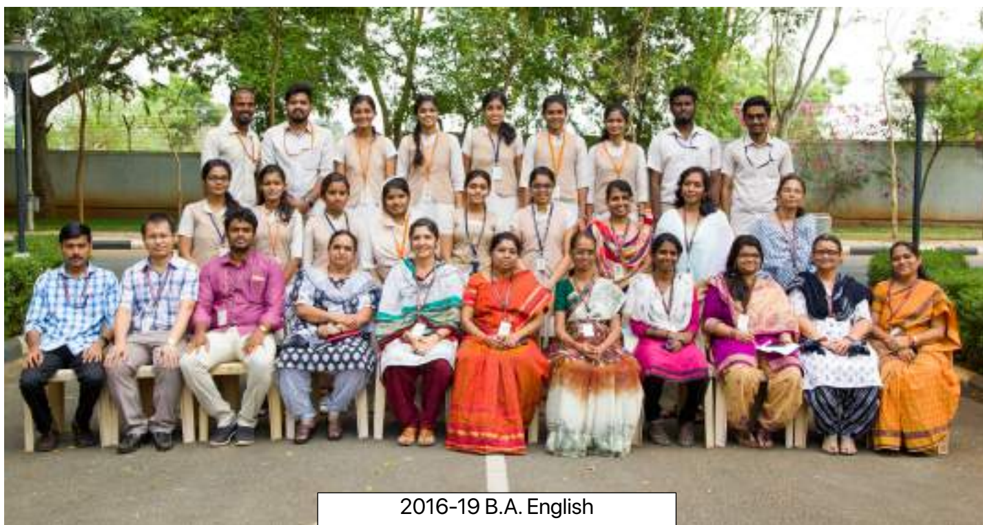
2016-19 B.A. English