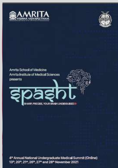
SPASHT 2021 Brochure