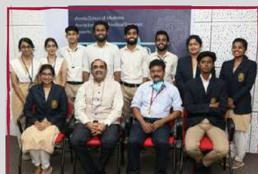
SPASHT 2021 team

SPASHT 2021 was the fourth edition of the annual undergraduate conference hosted by Amrita Institute of Medical Sciences and Research Centre, Kochi.