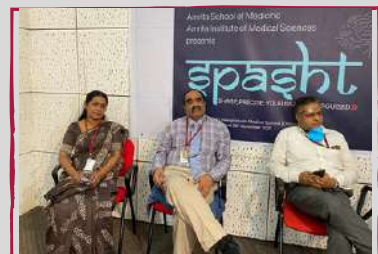
Committee members on inauguration Function