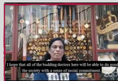
Padma Shri P T Usha addressing the function