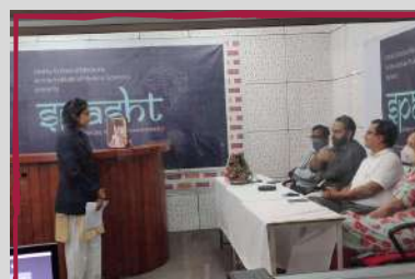
Cyber Knife and Radiation Oncology Workshop