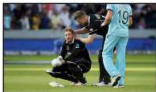
4 months and yet not over

On the whole, it was a bittersweet journey for millions of cricket fans as they witnessed one of the most intriguing cricket tournaments in recent times, filled with drama which summed up the