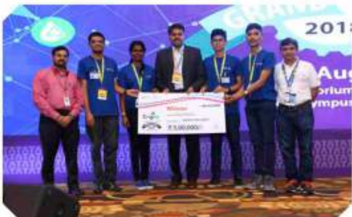
Cash price recieved by team VisionX

A MRITA Vishwa Vidyapeetham's Team Vision has won top honours in two prestigious international competitions held recently — TCS Digital Twin Challenge and Singapore-India Hackathon.