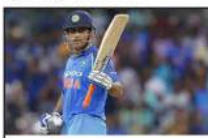
Dhoni after his splendid innings

The final was not short of controversial moments either. Simon Taufel, the retired Australian umpire admitted that the umpires made a 'clear mistake' of giving England 6 runs instead of 5, which was a violation of the MCC rules. The teams could not be separated even after a super over and New Zealand lost on the virtue of the number of boundaries scored.