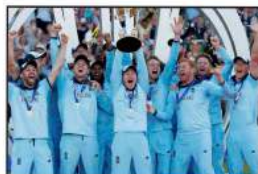
England rejoicing over their win

Many cricket fans from across the globe were in accordance with the gloomy English weather when cricket's most coveted tournament, the ICC World Cup 2019 was marred with bad playing conditions, lopsided contests, umpiring errors and controversies off the field. The international cricket body was constantly under the hammer for its action plan on