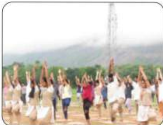
Students performing Yoga during the International Yoga Day celebrations on Ettimadai Campus.

Workshops were also conducted helping the students to understand Gita in a more profound way. Various workshops-- Shradha for concentration, Swayambak for cooking, were some other than the adventure games to help the participants overcome fear, etc.